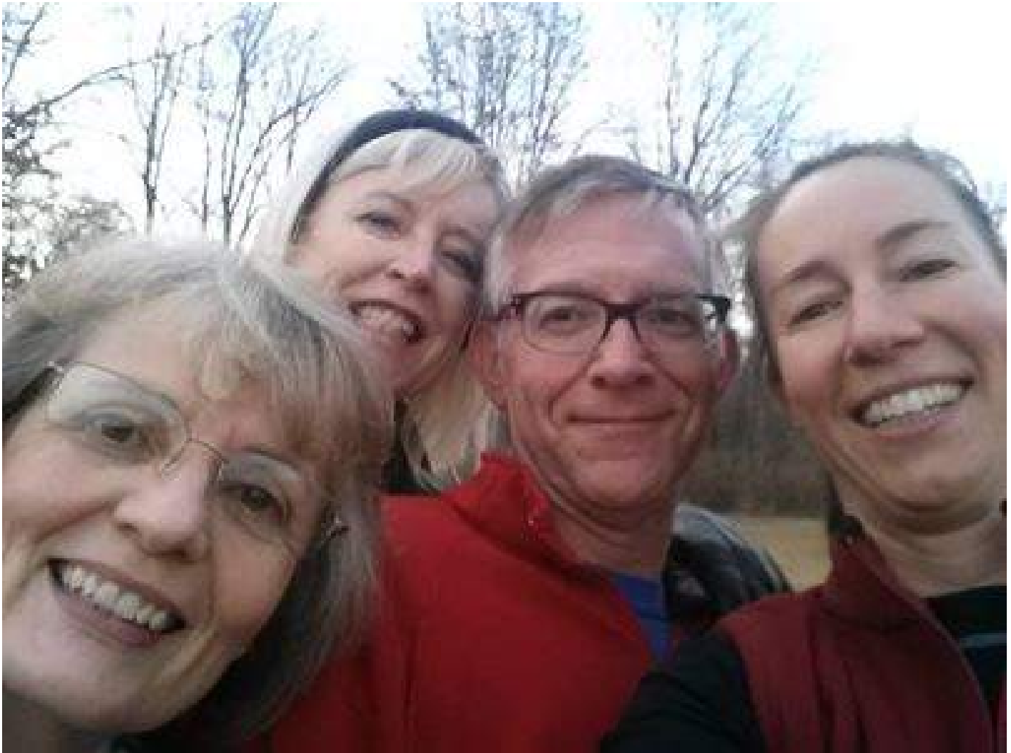
Walking with The Coach on a beautiful Tuesday morning !!!