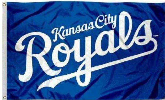
Do Not Duplicate