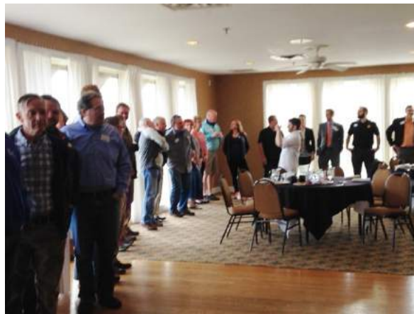
Lined up by seniority, youngest to oldest.