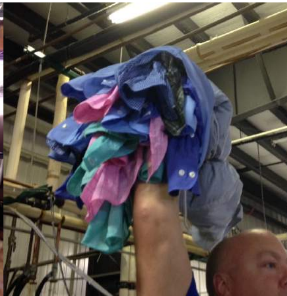
“The crap in the dark solvent is what came out of YOUR clothes.” Ten shirts in a bundle; 90 per wash load.