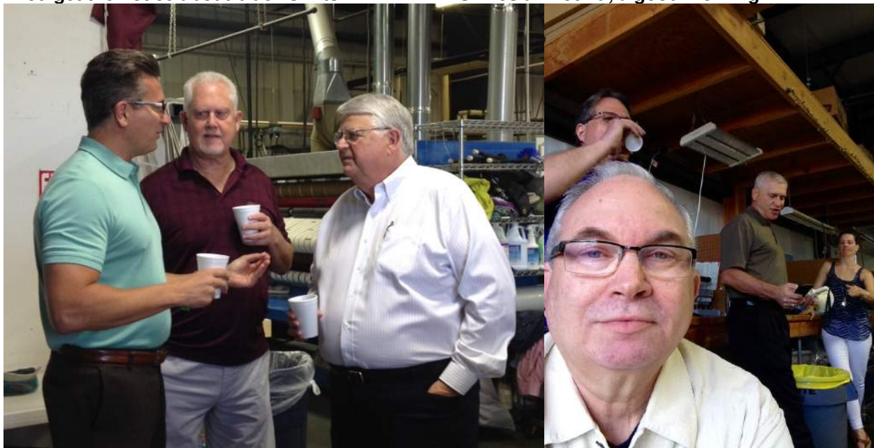
Sharing a morning cup of Joe.