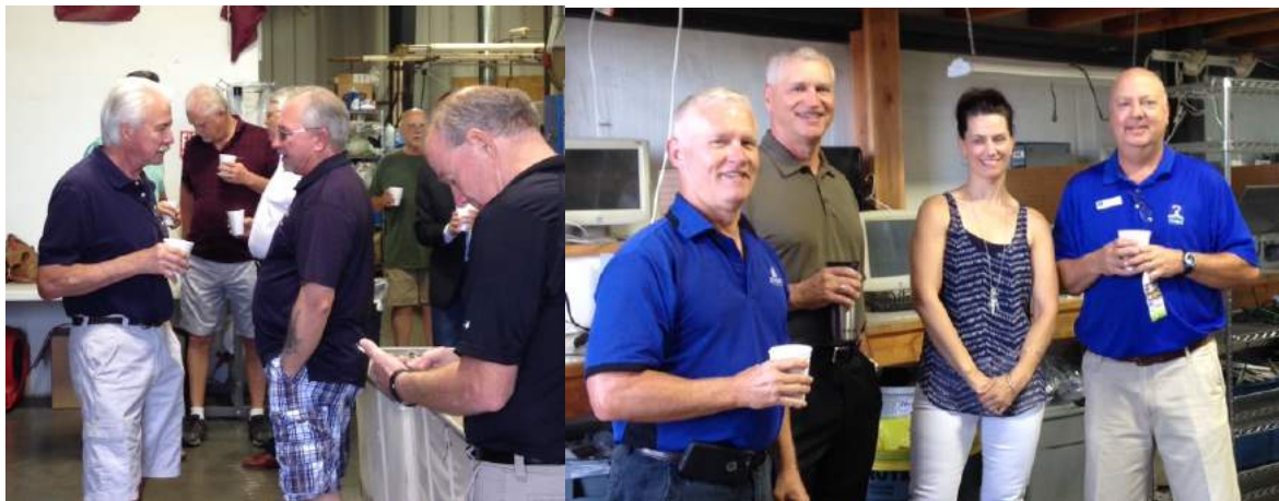
“You get the notice about black shirts?”