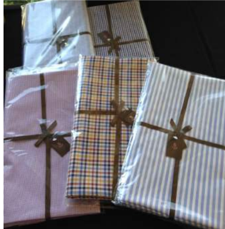
What shirt pattern do you like?