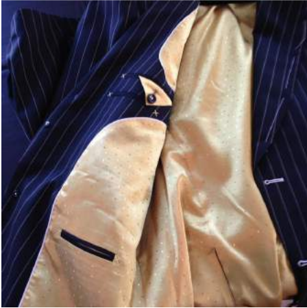
Inside as pretty as outside?