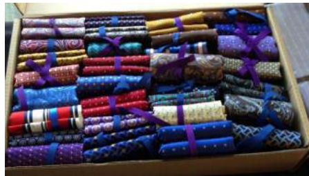
If you can't pick a tie pattern from these, something's wrong.