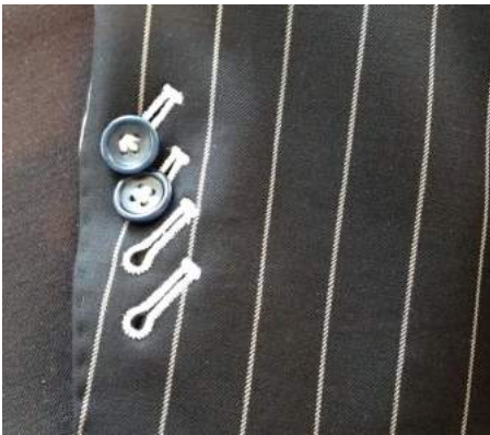
Functional buttons on a slant – cool !!