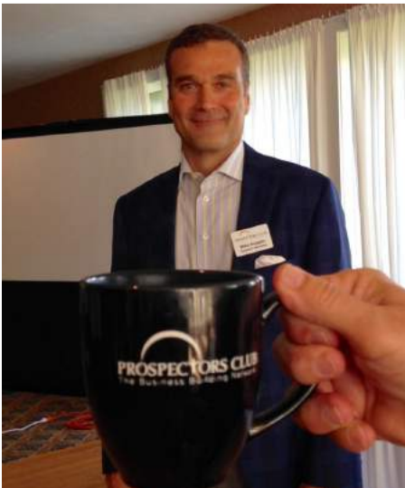
One of the "Best Dressed Men" we have in PBC.